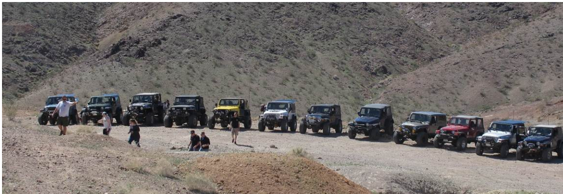
March 8 th Calico Run near The Bismarck Mine