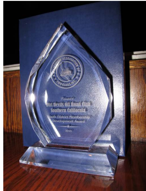
CAL 4 Wheel Drive, new member award